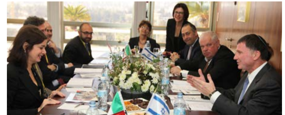
Knesset Speaker MK Yuli Edelstein with head of Italian Parliament Laura Boldrini

“Of course. I will give you an example from one of the tours that I led with foreign visitors, as the minister of hasbara as well as in the role of head of the Knesset – I took foreign journalists to the observation post in Beit Aryeh. This is an observation point from which you can see the Ben Gurion Airport and you understand how anyone who comes there with a shoulder launched missile or even a good sniper could shut down all flight activity to Israel. The goal is, of course, to show the severe danger of giving up territory, but even before I began the tour I told them ‘Listen, friends, everything that I am about to tell you from a security point of view is correct, but I would not dare to invite you to this observation point looking out at the airport if I were not totally sure that we have every right to this territory, that we are not stealing land, it is ours and we are here because of our rights and not because of any favors, because if this were not so, it would lack any foundation. Security claims do not justify holding territory if it is not mine. The fact that I fear that thieves might come from the direction of your house cannot justify my taking over your house. After I have stated this fact I can begin with the security explanation. Otherwise nothing means anything. It must all begin with our rights”.