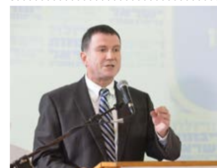
Knesset Speaker MK Yuli Edelstein at the 3rd Sovereignty Conference organized by Women in Green.

‘Up until now, they have been trying to erect a building without foundations’