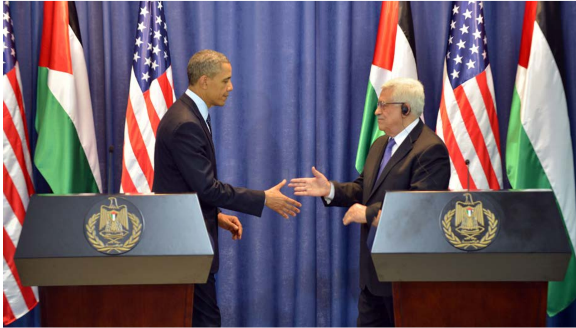
One need not be a prophet in order to know what a monster would be born from the Palestinian "embryonic state" in Judea and Samaria.

This embryonic state carries out - in schools, in mosques and in the media - brainwashing on an entire generation. It puts into the heads of its youth the idea that "there is no solution to the Palestinian problem other than by means of "jihad"