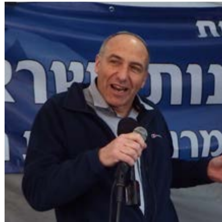
MK Col. (Res.) Moti Yogev at the Mothers' Vigil for Sovereignty 2014.

"Any international promise is worthless. It was so in Lebanon also, as well as in Sinai and in the Golan Heights and the best example is from last year in the Golan Heights where UN forces were overcome and they retreated. No Norwegian mother would send her son to endanger himself on the border between Israel and its neighbors. Such forces are actually no longer relevant in the Middle East. Even American forces would not be loyal to our defense. Until now, they could be depended upon only to