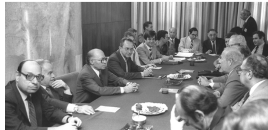
Prime Minister Menachem Begin with Secretary of State George Shultz 1983

Arens reminds us that there have already been leaders who stood up for Israel in the face of American dictates, and under much tougher circumstances. "Begin did it and he told them that we are not a banana republic. Why is it a problem to say this?" he says, and mentions that this stance was taken with the Americans during the period when Israel's economic dependence was far greater than that of today. "The State of Israel has progressed in giant steps since then. Israel of today is a relatively rich state showing impressive growth for years. It is nice to get grants but we must remember that this support also serves American interests. These are not gifts. But even during the economic crisis, when there was no choice and they had to cut their governmental budget, and also the support to Israel, it became clear even then that we can even get by without this. Their support represents perhaps one and a half percent of the Israel gross national product and if this is decreased or eliminated it will not harm us, and certainly not harm us critically. We do not need to change direction because of some dependence or other on a friend like the United States". ■