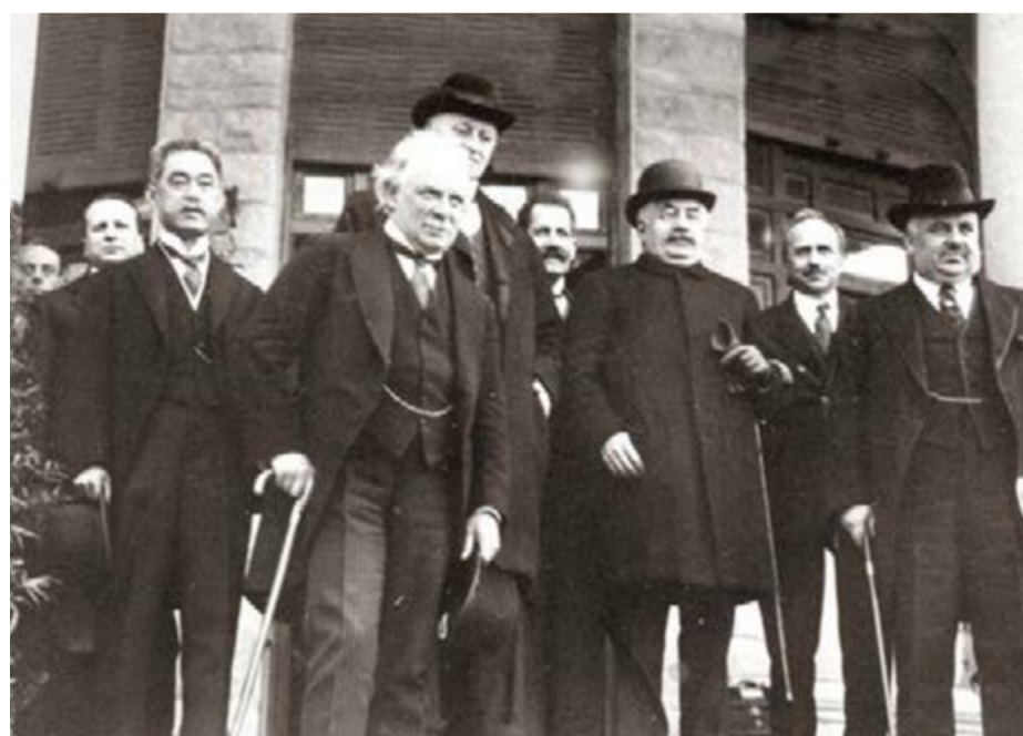
The San Remo Conference April 25th, 1920. With thanks to CILR Canadians for Israel's Legal Rights.

This international paragraph received more reinforcement a few decades ago in the shadow of the African conflict, which, seemingly, does not relate to the Jewish People. "In southwest Africa, in the country that today is called Namibia, there were arguments about the rights that had been recognized by the League of Nations. In the decision of the court in The Hague, it was said that all of the rights that had been