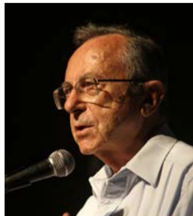
Prof. Moshe Arens

Their support represents perhaps one and a half percent of the Israel gross national product and if this is decreased or eliminated it will not harm us, and certainly not harm us critically. We do not need to change direction because of some dependence or other on a friend like the United States.