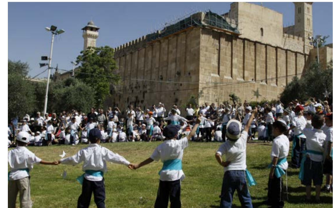
Children celebrate near the Machpela Cave in Hebron, City of our Forefathers

Hizb’Allah, and she is the one who went to Abu Mazen and sold him everything, getting nothing in return and he told her that it is not enough and he wants more. She also was one of the supporters of the expulsion from Gush Katif, so you ask me if she doesn’t understand? No. She does not understand. There are people to whom, unfortunately, the regional reality is not clear to them. They prefer to dig in their heels and stick to the old slogans that have lost their value. They promised us democracy and openness in the Arab Spring and we see what we got. Any child could analyze the reality around us but there are those who prefer to ignore it. It is not only you and I who must ask this question, but anyone who will be voting in the near future”.