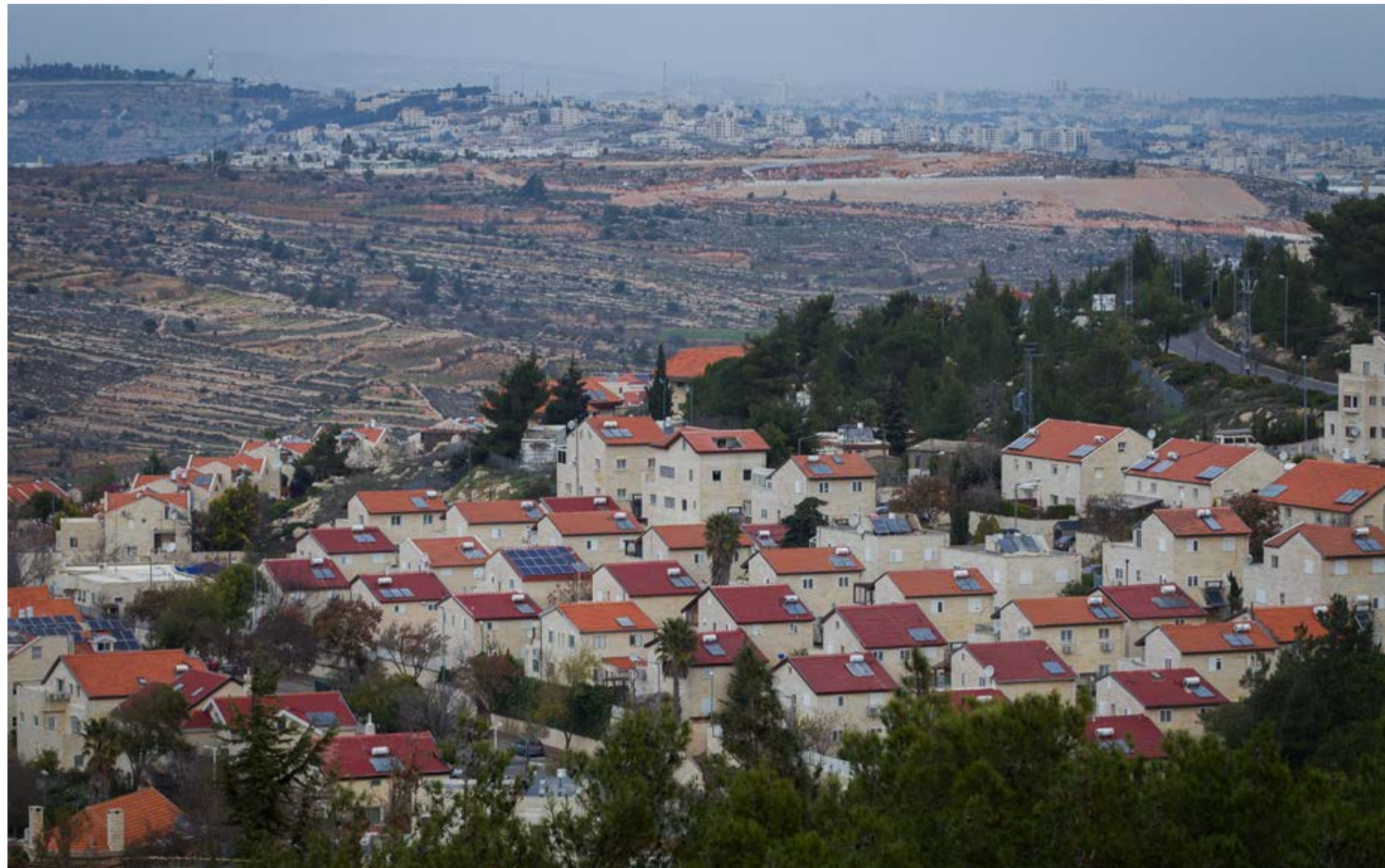
The Palestinians do not want only Judea and Samaria. They see the goal as a Palestine from Metulla to Eilat. The community of Efrat between Jerusalem and Hebron

him what is said in the PA internally, not in sanitized language, or in the polished and smiling English of Washington lounges, but rather, that which is relayed to the Palestinian masses, to the reader of the Palestinian newspapers, to the Palestinian child and in the rooms of the Muqata where decisions are taken.