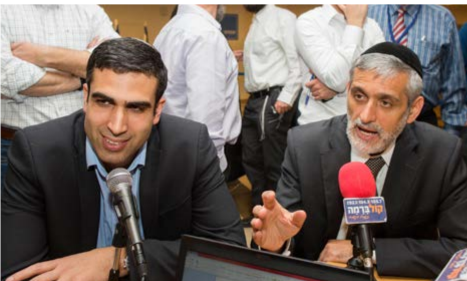
MK Yoni Chetboun with MK Rabbi Eli Yishai.

When he speaks of sovereignty, Chetboun does not ignore the demographic threat and in short, he repeats the summary of principles that he lays out in meetings with members of American Congress. "In '48, just before the declaration of the state, there was the same discussion between Haim Weizman and Ben Gurion. You can read the diaries of Ben Gurion and see that Weizman attacked Ben Gurion and told him that the idea of declaring a state at that time was an insane idea because there were only six hundred thousand Jews here and millions of Arabs all around. The result would be that the establishment of a state ruled by a minority is a recipe for killing the idea of a Zionist state. Ben Gurion had a very simple answer. He did not deny the reality but he said that there is a challenge before us, and millions of Jews will come to the Land, we will create here a strong economy and a strong society and things will stabilize. Today, between the sea and the Jordan the Jews are 66 percent. Data from the Central Bureau of Statistics show a critical decline in the Arab birth rate compared to the Jewish birth rate. You should analyze the data of Central Bureau of Statistics' Data and not read what is said by researchers who have an agenda. We have a task to perform, to bring immigrants, to strengthen the country and maintain this trend". ■