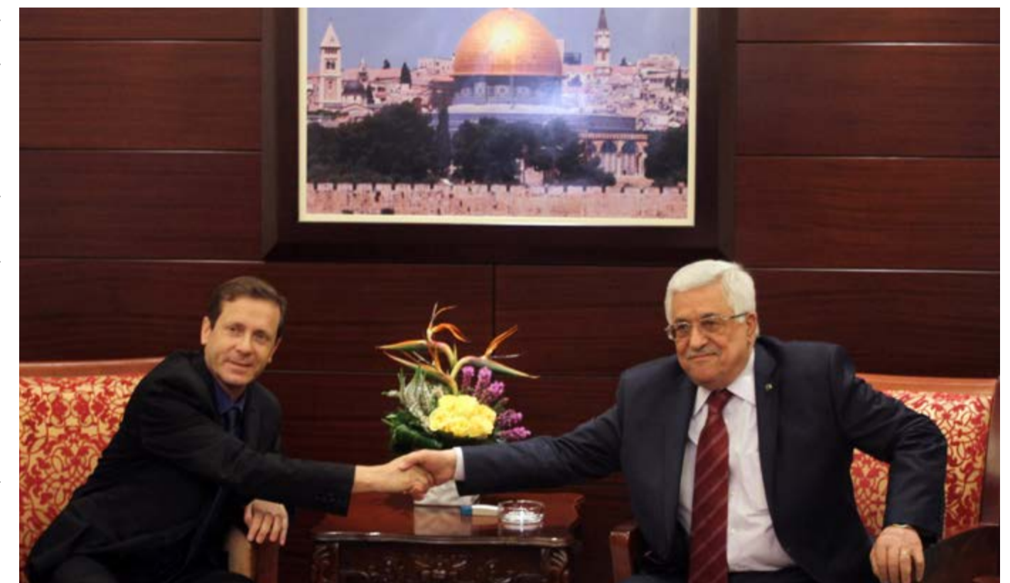
Some Israelis who aspire to leadership are shown to be naïve and therefore dangerous to Israel, since they are ready to accept whatever is told to them. Isac Herzog and Mahmoud Abbas.