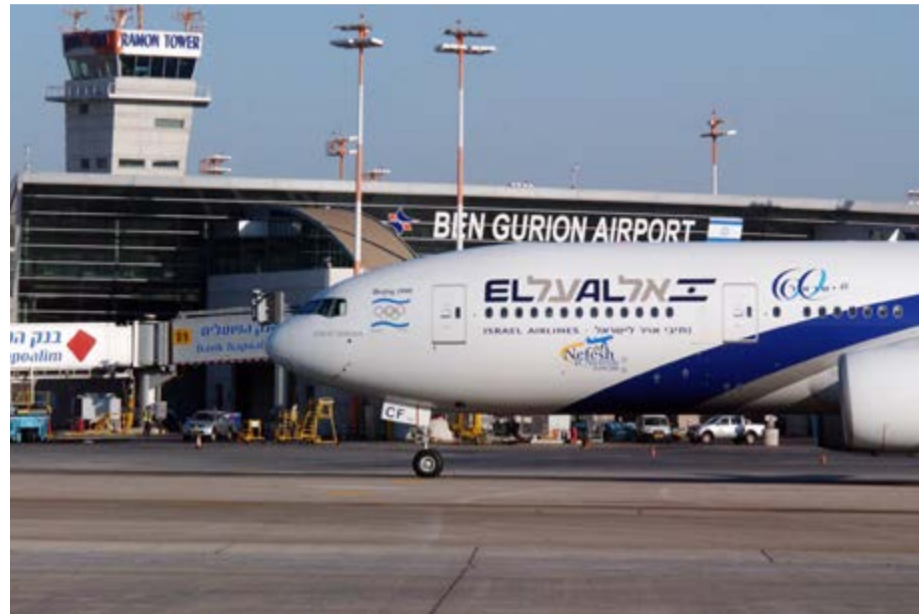
Ben Gurion Airport would be paralyzed, there would be no tourism, no commerce

there is no military. There are those who think that we will be able to remove the residents but maintain a military presence. There is no such animal. This is not the essential reason for our presence in Judea and Samaria but we must recognize this fact”.