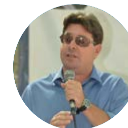
Dep. Min. Ofir Akunis at Oz veGaon

I have respect for the American forces, but our fate must only be in our own hands and no multi-national force will have the responsibility for our security.